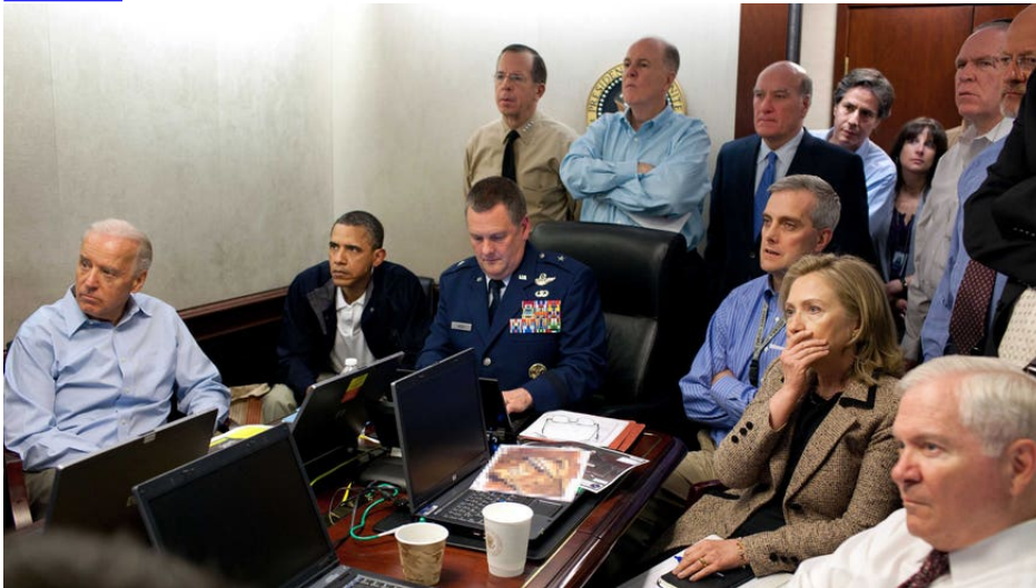
May 1: Secretary of State Hillary Rodham Clinton, President Barack Obama and Vice President Joe Biden, along with with members of the national security team, receive an update on the mission against Usama bin Laden in the Situation Room of the White House.

The Gawker website is under fire for trying to expose the CIA agent who may have helped lead the effort to kill Usama Bin Laden — despite efforts by the U.S. government and media to keep his identity secret for security reasons.